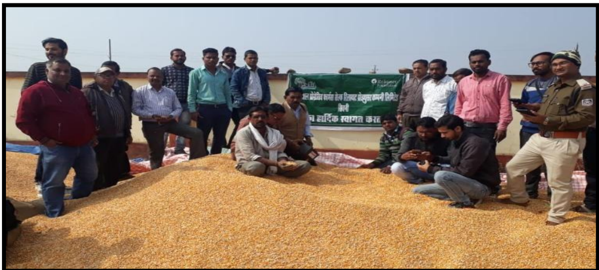
Members of Mahakaushal Farmer Producer Company at eNAM Seoni with their Maize Produce