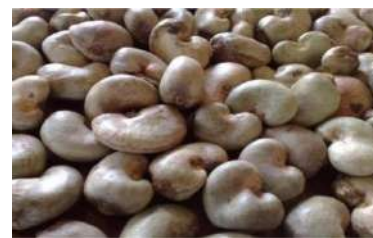
Actual Picture above for illustration