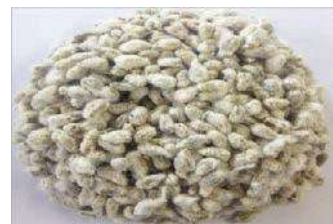
Actual Picture for illustration