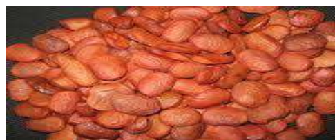
Actual Picture for illustration